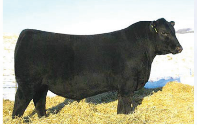
S A V BLOODLINE 9578 | SIRE OF LOT 1B