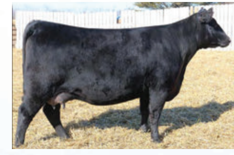
MUSGRAVE QUEEN A609 1433 | DAM OF EMBRYOS

Something that is surely to catch anyone's eye are these reverse sorted eggs that add outcross on the bottom side of the pedigree. 1433 is the first ever female sold by public auction out of the legendary flag 0649. Of course, she is the mother of the famous Musgrave Sky High, making 1433 a maternal sister to him. These type of matings don't come along very often and we are sure proud to own a daughter of 1433. These reverse sorted eggs are highly maternal with loads of potential.