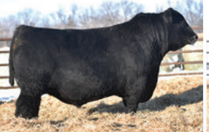
D&N RAINFALL 23H | SON OF RAINFALL