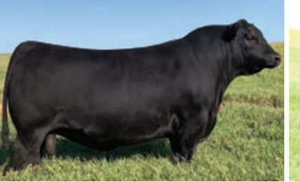
S A V AMERICA 8018 | SIRE OF EMBRYOS