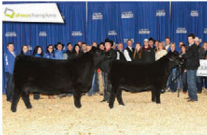
BAR-E-L ERICA 74A | NATURAL LAW DAUGHTER