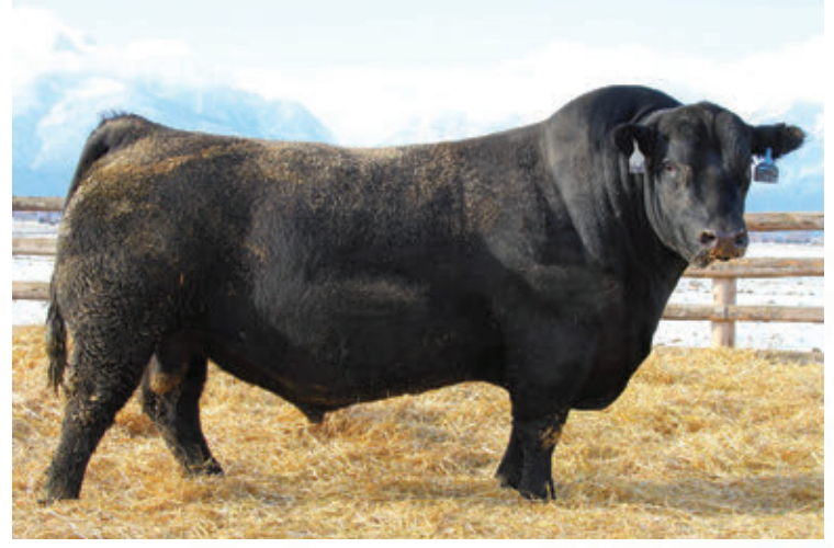
COLEMAN CHARLO 0256 | SIRE OF LOT 1C