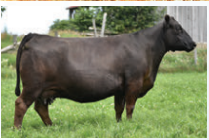
JL FOREVER LADY 6104 | FULL SISTER TO DAM OF EMBRYOS, SOLD FOR $44,000 TO REHORST FARMS

In amongst a sale filled with historic breed legends, 9078 stands up as a female that has already claimed her title as a household name within the Angus community. This highly regarded female is a production factory with a plethora of Angus heritage behind her. And we would be remiss to mention Angus heritage without discussing Johnson Livestock, where her famous donor dam, 1280, is noted as being one of the best females to ever come from the program, with a novel of outstanding progeny records. 9078's physical outline is stunning from every angle, and she has already produced progeny that have as much tomorrow in them as any in the industry today. Embryos highlighted the recent February Freeze sale, fetching $2400 per to Carelea Farms. Mate this female however you want, and sit back and reap the rewards of your own piece of Angus history.