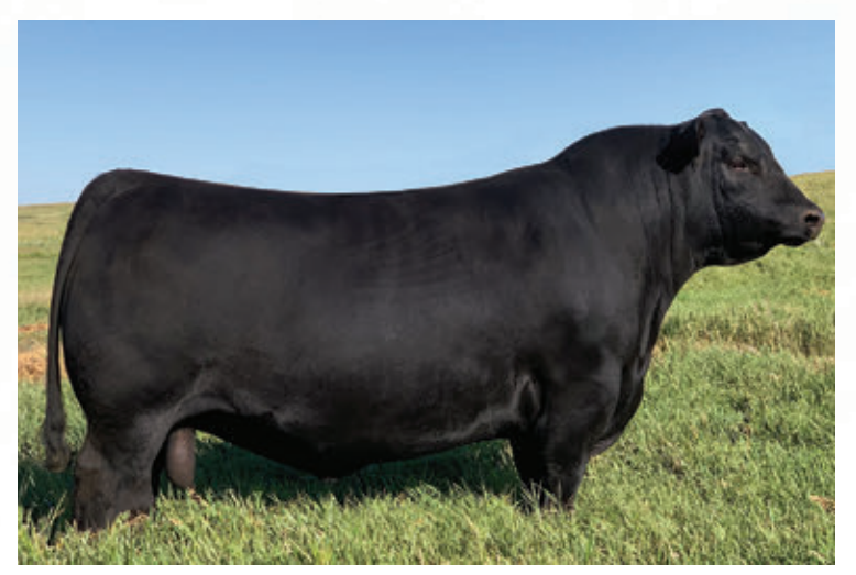
S A V AMERICA 8018 | SIRE OF LOT 1A